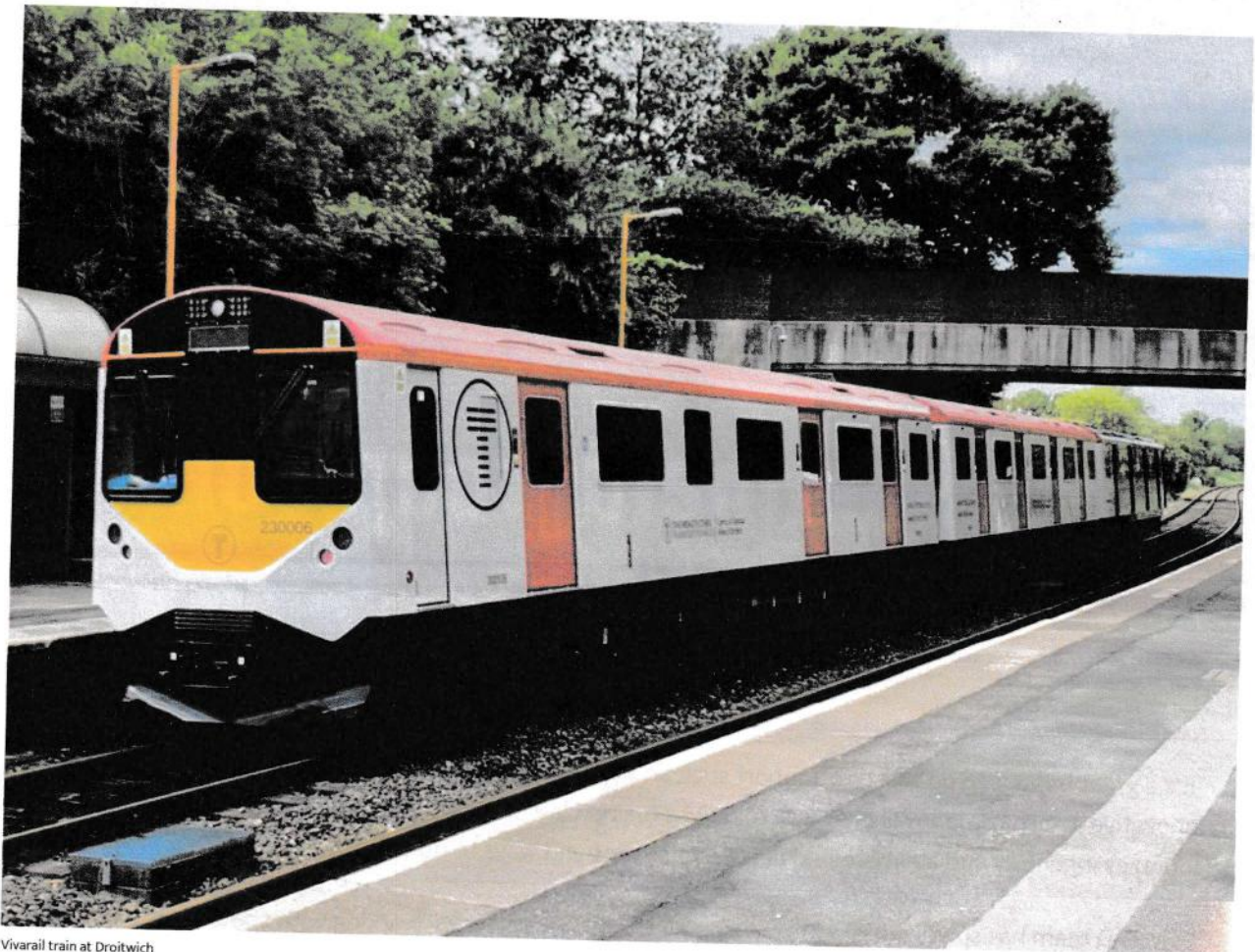
Vivarail train at Droitwich

Vivarail's next-generation battery train will be launched at the international climate change conference COP26 this November, and will run daily services throughout the event.