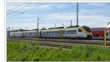
Operating in Germany, Siemens Mireo Plus B battery-overhead wire trains, with a range of 80 km on battery only operation. [ edit ]

The New Athos Cave Railway in Abkhazia in the country of Georgia has three narrow-gauge battery electric multiple units built by the Railroad Machinery Plants of Riga in Latvia . Two Ep «Tourist» trains were built in 1975 and later modernized in 2005 and 2009, and the new Ep-563 train was built in 2014. [22] Since 2014 this it been the only train in use. The first Ep train is based at Anakopea station for doubling the Ep 563 train in case of malfunction. Another Ep train is based at the depot. [22] Each train consists of 6 cars, including 1 control car with motors and power equipment and 5 trailer cars for passengers. [23] Both models can run either on a third rail with 300 V DC or batteries with 240V DC being used for short unelectrified sections at switches without a third rail, and also at passenger stations where the third rail has no voltage for safety reasons. [24]