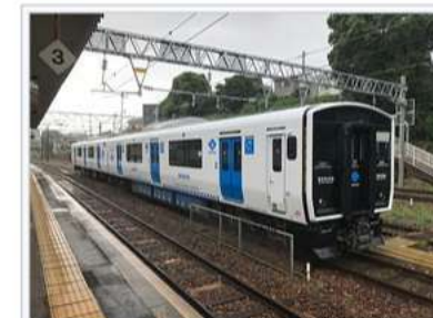
BEC819 at Kashii Station 📷

In 2019, a total of 11 new BEC819 trainsets were introduced on the Kashii Line , replacing all diesel multiple units previously operated on that line. [38][39][40] This brought the total number of BEC819 trainsets in revenue service to 18.