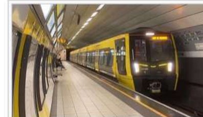
Class 777. Stadler, conducted battery-electric trials in Liverpool . [ edit ]