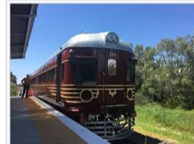
The solar-powered Byron Bay Train ↗ in Byron Bay, Australia

CAF Urbos 3 supercapacitor powered trams operate on the Newcastle Light Rail network with trams being recharged at each stop. The Canberra and Parramatta light rail networks are also planning to introduce battery powered CAF Urbos 3 vehicles on their networks. They will operate on battery power on select parts of their networks. [16]