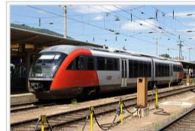
Siemens Desiro battery train being ↗ trialled in Austria

The Austrian Federal Railways has purchased 189 Siemens Desiro ML trains from 2013 to 2020. One of these trains was converted to a battery electric multiple unit and branded as cityjet eco . The battery-electric version of the Siemens train is equipped to operate with batteries and overhead wires, with a battery only range of 80km reaching a maximum speed of 100 km/h in battery mode. The trains are to be tested on regional and suburban rail lines on electrified and unelectrified track. The test services began in September 2019 on the Kamp Valley line between Horn and St. Pölten . [2][17]