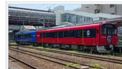
EV-E801 at Oiwake Station, Akita 📷

A new EV-E801 series two-car BEMU train was introduced on the 26.6 km (16.5 mi) long non-electrified Oga Line in Akita Prefecture in March 2017. It shares some characteristics with the BEC819 trains: it uses a 360 kWh battery and is recharged from a 20 kV 50 Hz AC overhead supply instead of a 1,500 V DC overhead supply used by the earlier EV-E301 trains. [41]