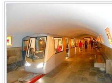
Ep-563 train at Anakopea station, New Athos Cave Railway in Georgia [ edit ]