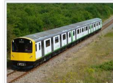
Vivarail battery electric train [ edit ]