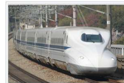
N700 bullet train with battery backup. ↪

In Japan, JR East tested a "NE Train Smart Denchi-kun" battery electric railcar from 2009. This vehicle is capable of operating under 1,500 V DC overhead wires or on battery power alone for a distance of up to 50 km away from an overhead power supply. [32] The batteries are charged via the pantograph either when running under an overhead electric supply or at a specially built recharging facility. [32][33]