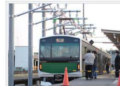
EV-E301 charging from the overhead conductor bar 📷

The trains recharge their batteries at Karasuyama Station (the end of the line) via their pantographs , using a rigid conductor bar placed where the overhead wires would be, connected to the local electric grid. At the other end, at Hōshakuji , the Karasuyama Line meets the electrified Tohoku Main Line . The trains then continue over the electrified Tohoku Main Line to Utsunomiya , where passengers can change to Shinkansen high-speed trains.