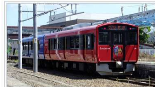
The Japanese lead the world in battery trains with at least 23 battery electric multiple units in regular operation, replacing diesel multiple units (DMU) on non-electrified routes or non-electrified sections of route.

From March 2014 passenger battery trains have been in operation in Japan on a number of lines. Austria has overhead wire/battery trains which became operational in 2019. [2] Britain successfully trialled fare paying passenger hybrid overhead wire/lithium battery trains in January and February 2015. [3]